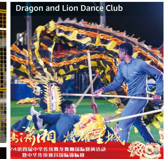
Dragon and Lion Dance Club