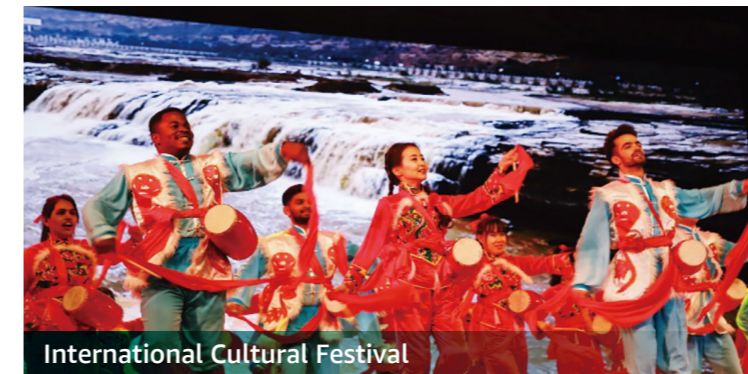
International Cultural Festival