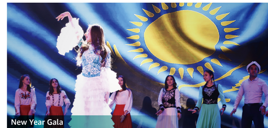
New Year Gala